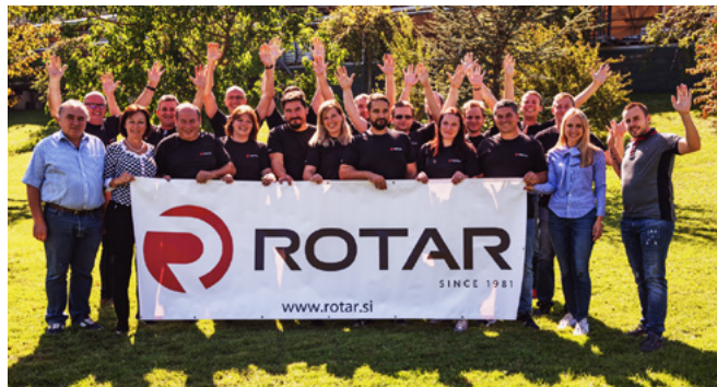
The ROTAR Company is a Slovenian family business which has been on the market since 1981.

Through four decades of continuous development and persistence on the path to excellence, ROTAR with its quality products has constantly adapted to the demanding market of Slovenia, Croatia and Bosnia and Herzegovina and defied strong competition, while maintaining an ear for the needs of its business partners and employees to become one of the leading companies in our field.